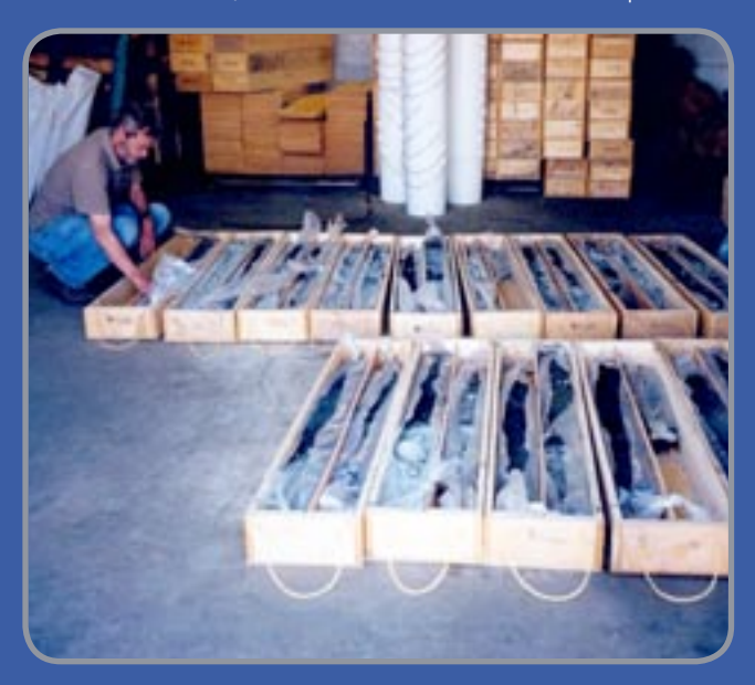
Placer gold core samples