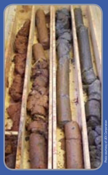
■ Uranium core samples