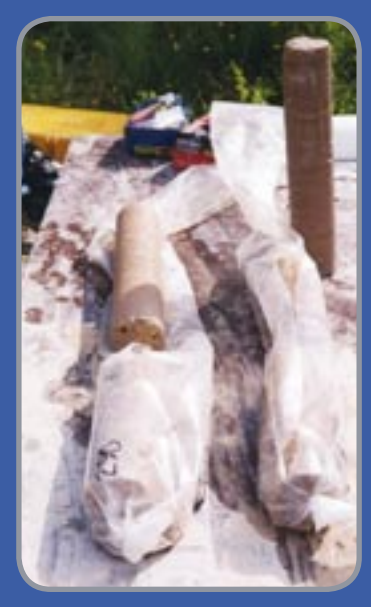
Dolomite lime core samples