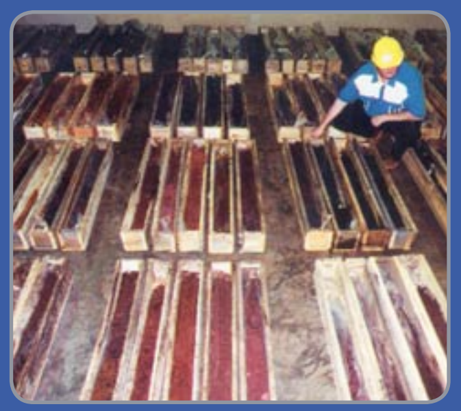
■ Manganese core samples