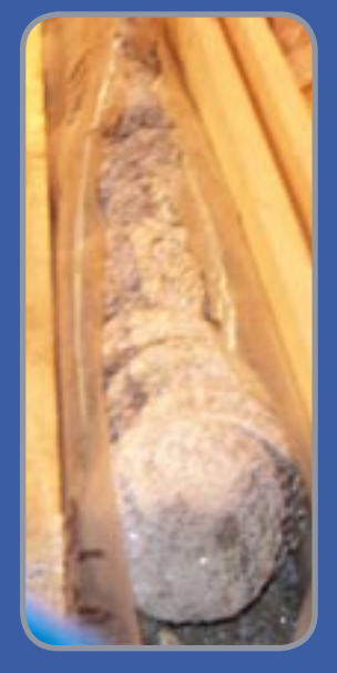
■ Kimberlite core sample