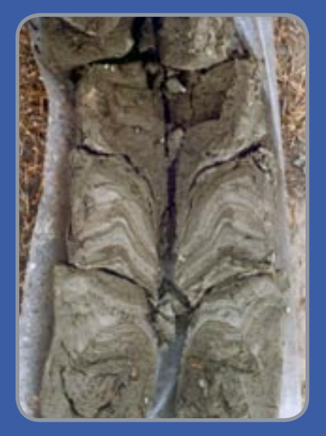
■ Mine tailing core sample